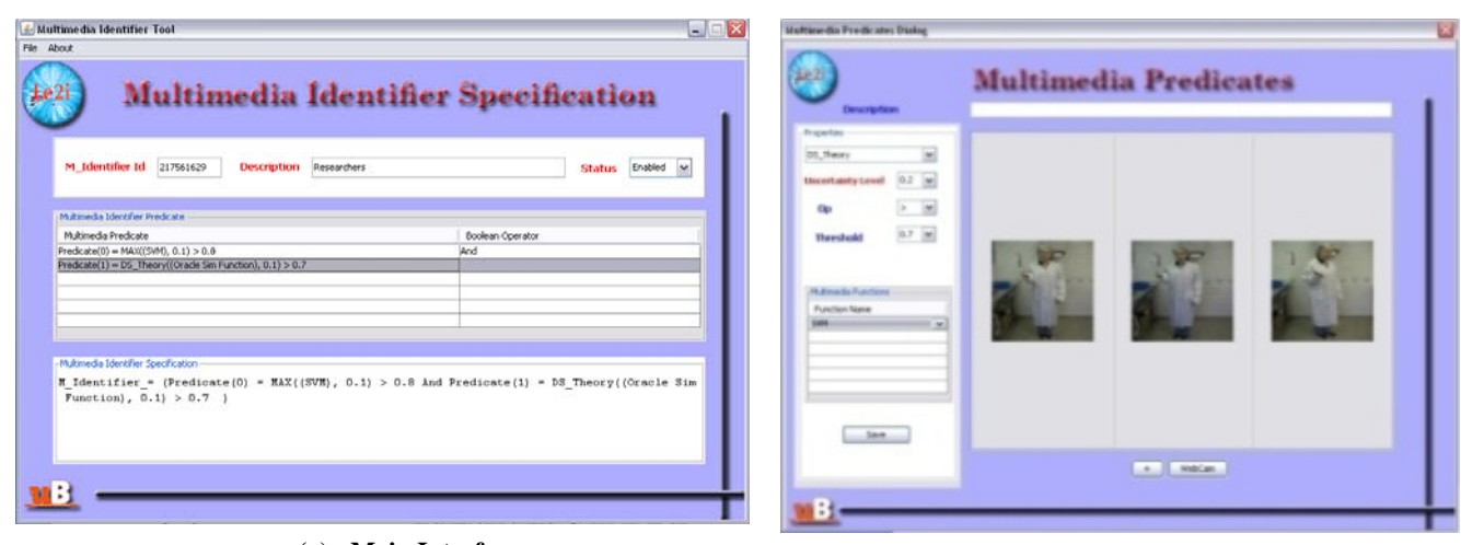
Figure 2: Permission Specification And Permission Assignment