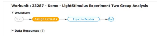
Figure 10: Assign Extracts Workflow

workflow. In data import workflow, for instance, the user must assign extracts to the imported files. The workflow-driven approach of B-Fabric is very useful in practice to reduce human mistakes and avoid skipping steps.