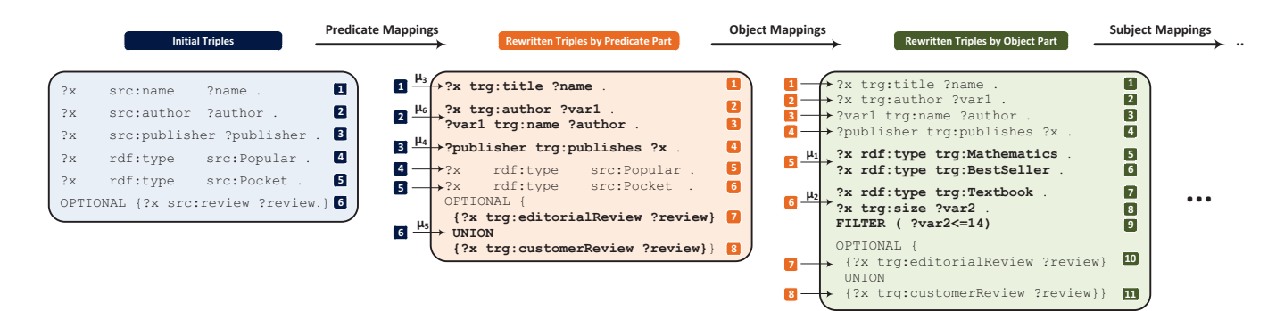
Fig. 3. SPARQL Graph Pattern Rewriting Process Example

Apart from these trivial property mappings, more complex ones can be also identified. For instance, the datatype property review can be mapped to the union of the datatype properties editorialReview and customerReview ( \mu_5 ), since the binary relations described by the property review correspond with the binary relations described by the properties editorialReview and customerReview.