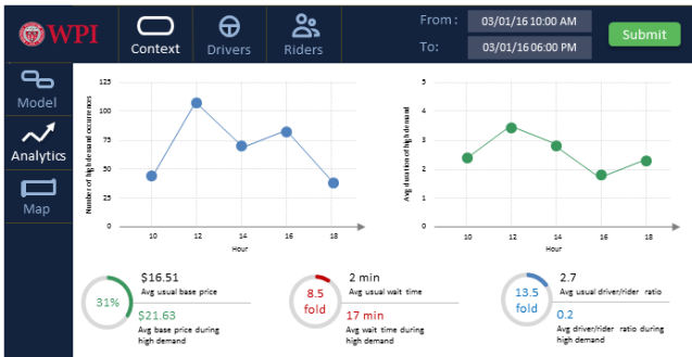
Figure 3: Analytics view

Execution Visualization. At runtime, the model view provides insights into event-driven context transitions (Figure 1). The current context and triggering transitions are temporally highlighted. Besides the real-time monitoring, the model view offers a slow-motion-replay mode that allows the users to step-through the history of prior execution to better understand, debug, and reconfigure the model. This functionality provides the audience a visual opportunity to learn how the CAESAR model functions.