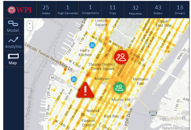
Figure 4: Map view

In addition to the complex events that are automatically derived by queries, the audience will learn about common manual actions which include area specific information such as accidents, road construction, gas prices, police cars etc. This information will be added by clicking on the respective location on the map and choosing the information in a drop-down menu. A respective icon will appear on the map. For example, one traffic hazard is depicted in Figure 4. Based on this information, travel time and cost will be estimated to compute the best route of each trip.