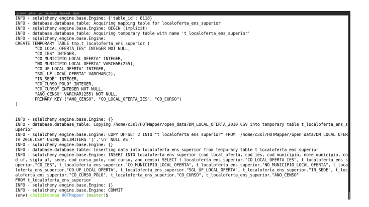
Figure 3: Screenshot of the insertion execution flow

The screen shot of the execution log is shown in Figure 3. The command first inserts the table into a temporary table, with the same structure as the input CSV, in a bulk insert action. Then, it inserts the data into a final table applying the mapping definitions. If this insertion is successful, the tool commits all changes to the MonetDb database. Once a first insertion is done, we will execute the drop command (./manage.py drop localoferta_ens_superior), and the audience can propose alterations to the mapping definition file to see different outcomes.